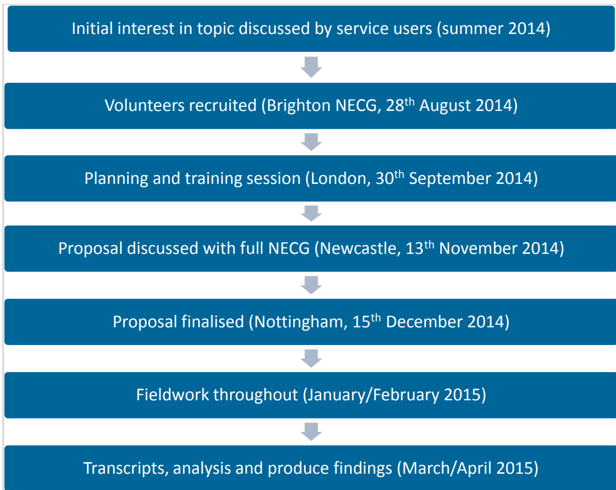
Figure 1 – Timeline for first national peer-led research project

The peer research group developed the methodology through an initial planning session, supported by CFE Research, where the strengths and weaknesses of different approaches were discussed. Initially, the proposal was to conduct semi-structured interviews with project staff and run a focus group with service users for those who were involved in the recruitment process. However, having piloted this approach with the full NECG it was evident that this was not the most appropriate method to adopt. The number of service users with direct involvement in the recruitment process was not enough to warrant a focus group approach. Generally, there were only a few service users with direct involvement in recruitment at each project and their views could best be elicited through depth interviews. Bringing together such individuals from different projects could be inconvenient and costly. Also, the peer researchers were more confident with conducting interviews as oppose to facilitating a focus group so could better exert their influence on the research through this method.